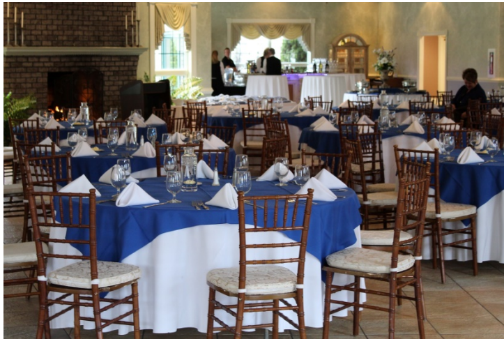
Current hygiene regulations require sophisticated seating management to ensure the minimum distance between restaurant visitors.

DEUTSCHE INSTITUTE FÜR TEXTIL+FASERFORSCHUNG