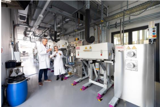
Coating plant in the DITF

DEUTSCHE INSTITUTE FÜR TEXTIL+FASERFORSCHUNG