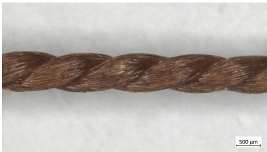
PA6.6-yarn with bonding agent made of HMF (macroscopic image)