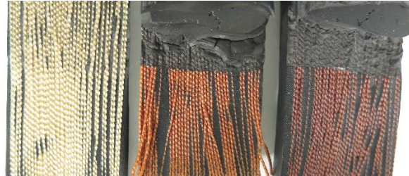
Adhesion of polyamide 6.6 to rubber: without adhesion promoter (left) with RFL-Dip (center) with HMF-Dip (right)